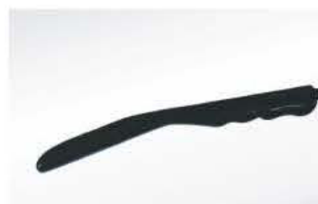
6.5MHz multi-frequency linear rectal probe (handle)