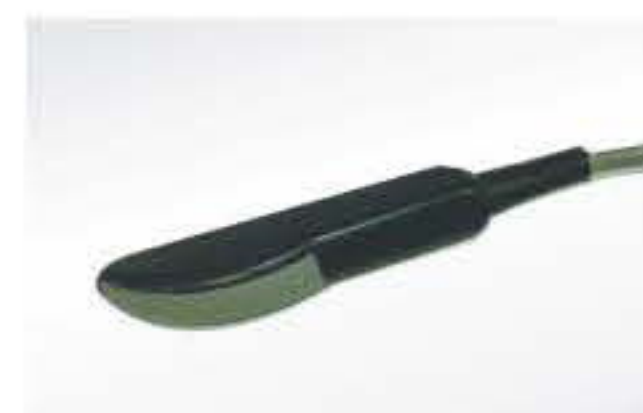
4.0MHz multi-frequency rectal convex Probe