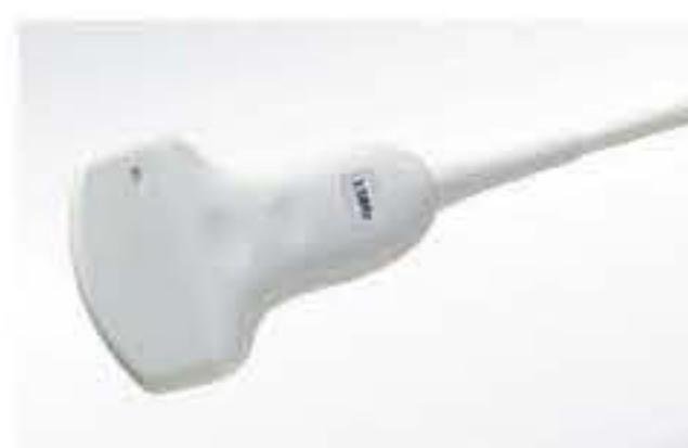
3.5MHz multi-frequency convex probe