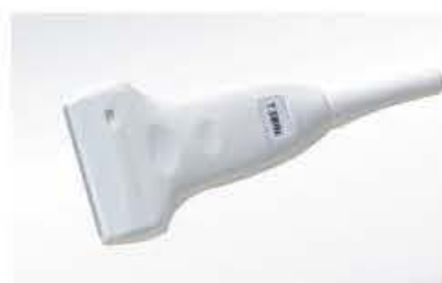
7.5MHz high multi-frequency liner probe