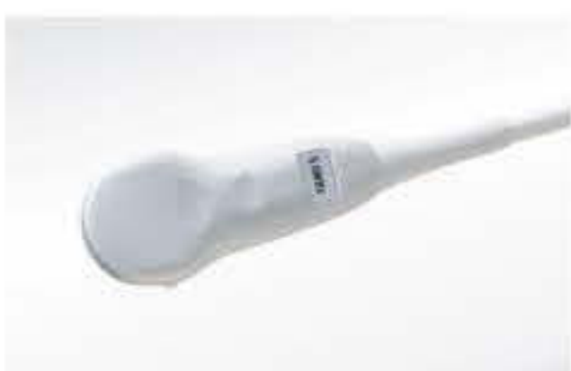
5.0MHz multi-frequency micro convex probe