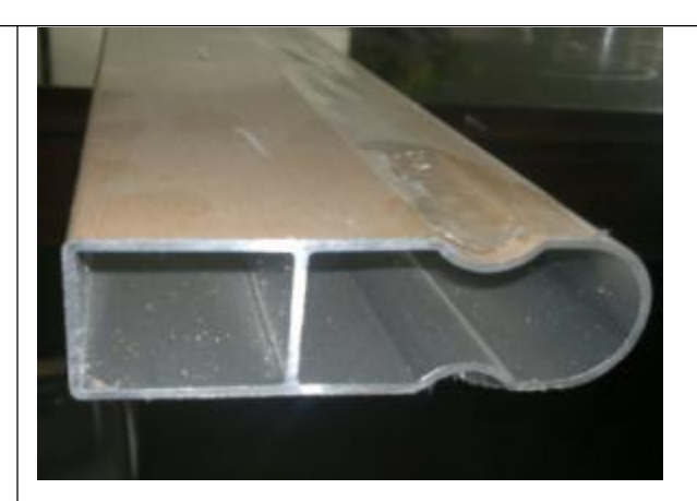
Wooden imitation aluminum alloy side rails