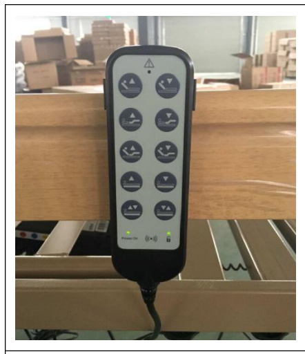
Hand Controller with conductive switch in case of wrong operation