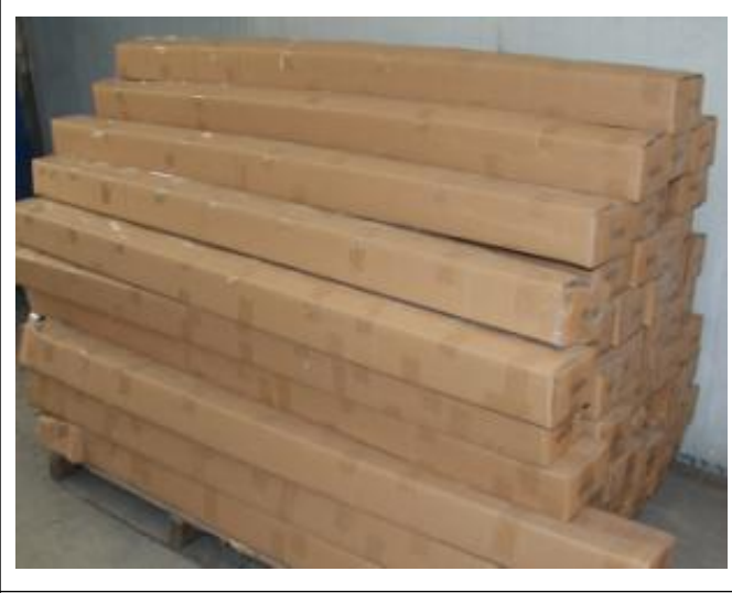
Bed frame and headboard/footboard